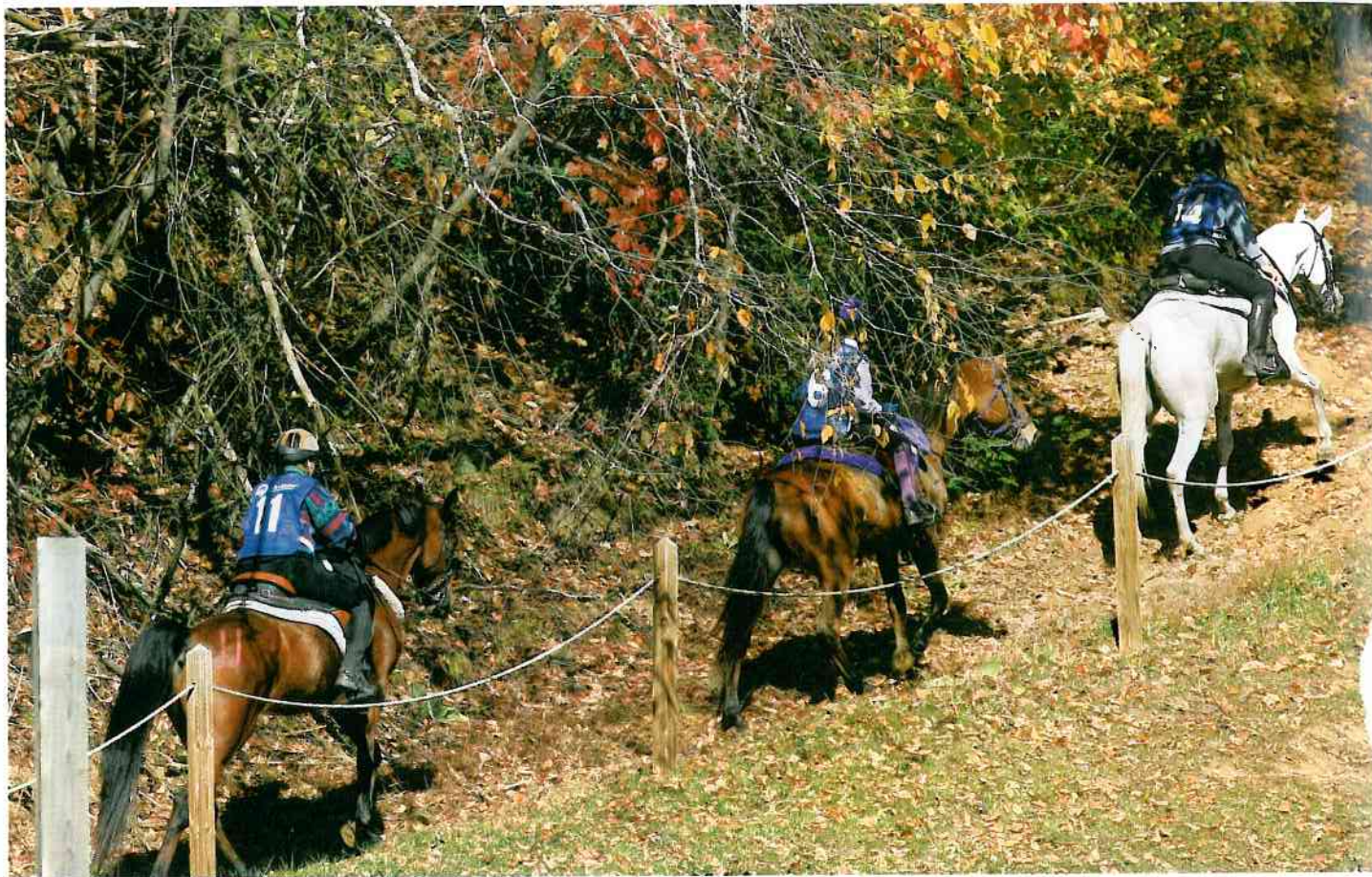
Riders depart camp for the second loop on the first day.

to mold a champion trail horse. This can be accomplished alone with one's horse, but it's usually more fun to have a training partner.